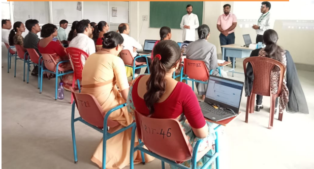
Training session: Comprehensive ERP Applications